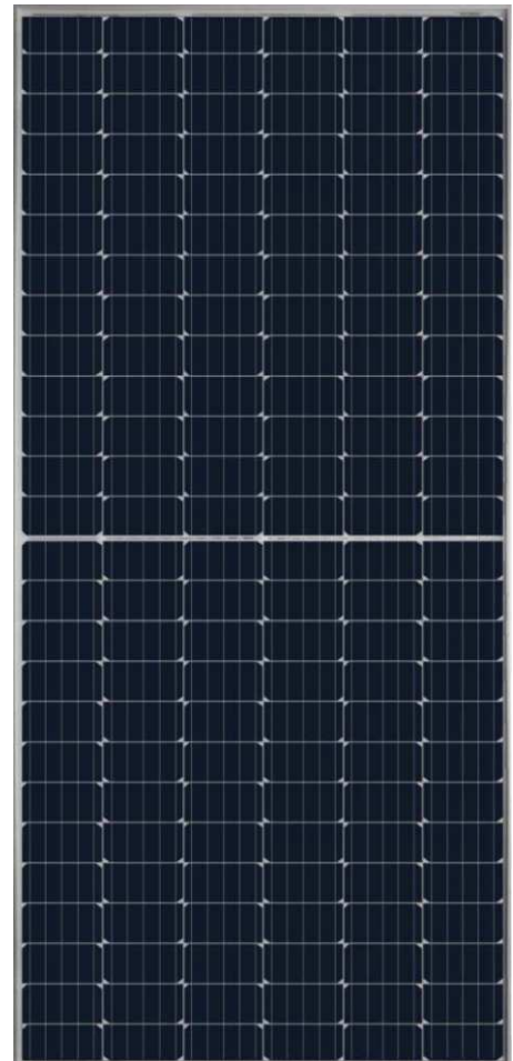
PV Module 25 Years Linear Performance Warranty